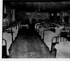
DORMITORY area for men in Unit I shows the face lifting the hospital has undergone in the past two years. Above, is the old row-in-row bed arrangement. In photo below is the new four-bed area with recreational space.