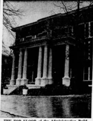
THE TOP FLOOR of the Administration Building at Eastern State Hospital shows the old ballroom where dances were held in the earlier days of the institution. (Staff Photo).