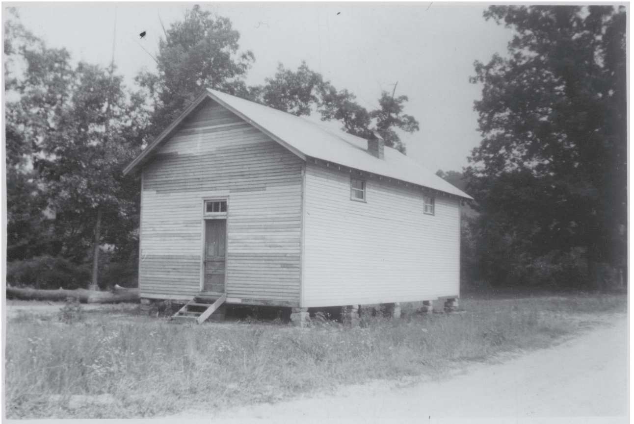
Greasy Creek Church 1940