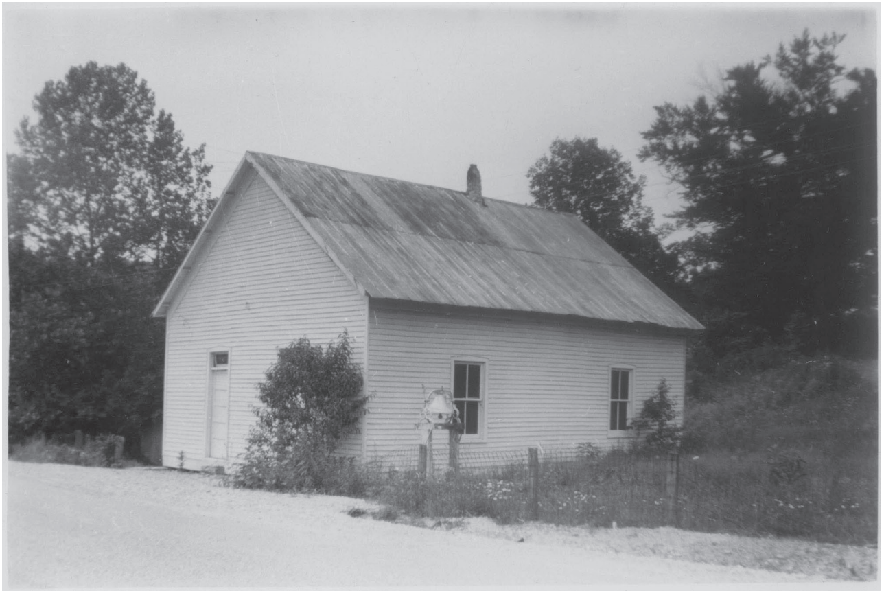
White Oak 1940