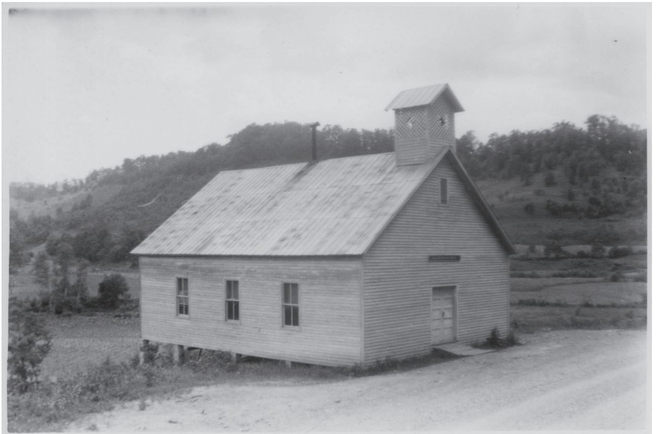
Williams Creek (Calosse) 1940