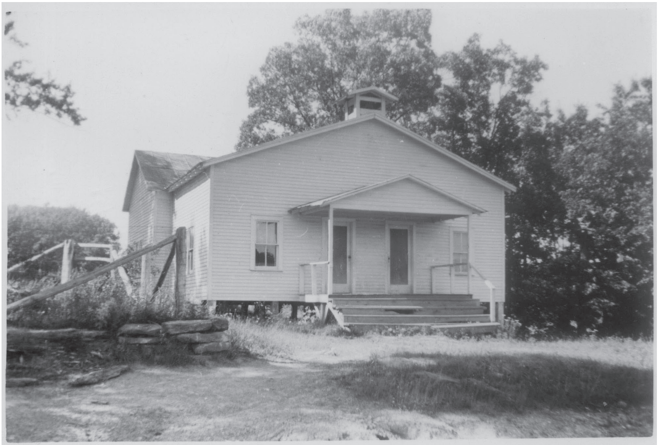
Blair's Mill 1940