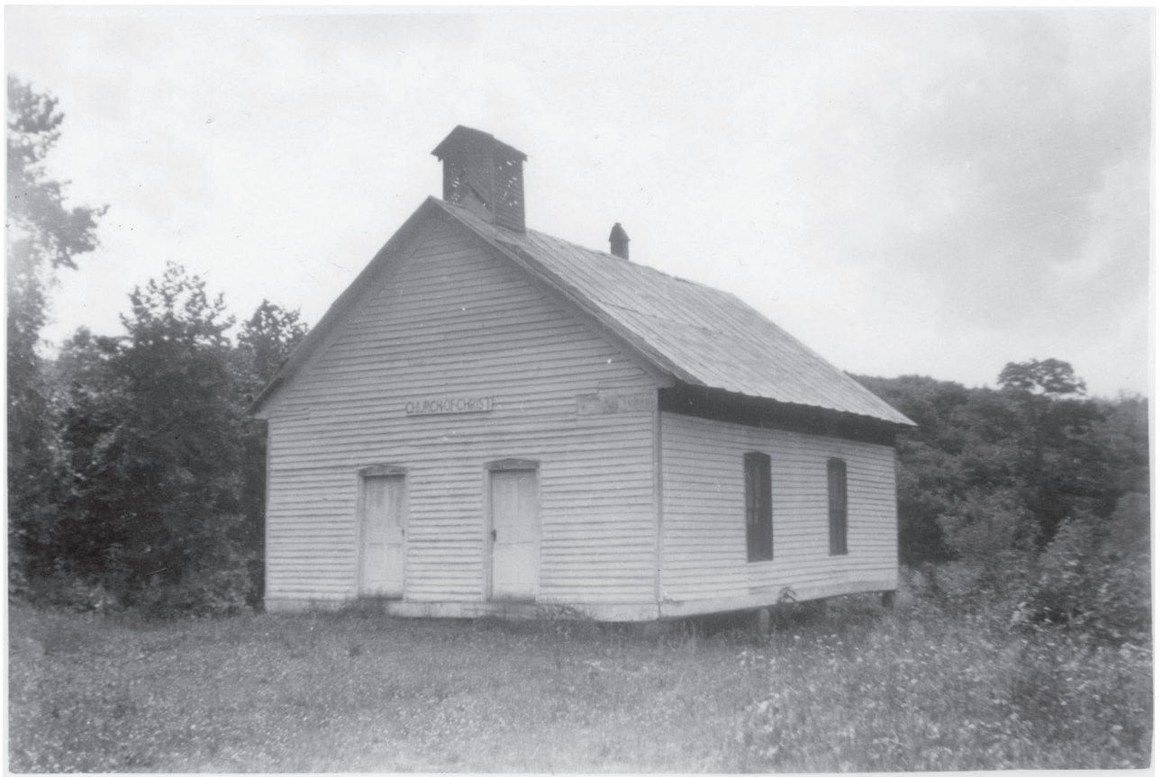
Bethany (Tarkill) 1940