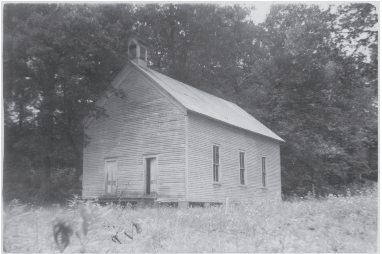
Old Grassy Church 1940