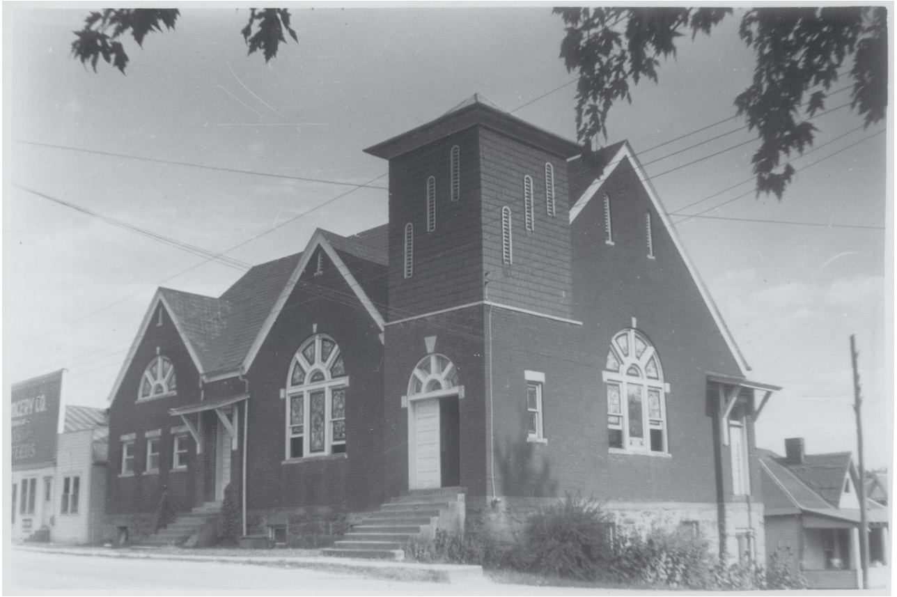
West Liberty 1940