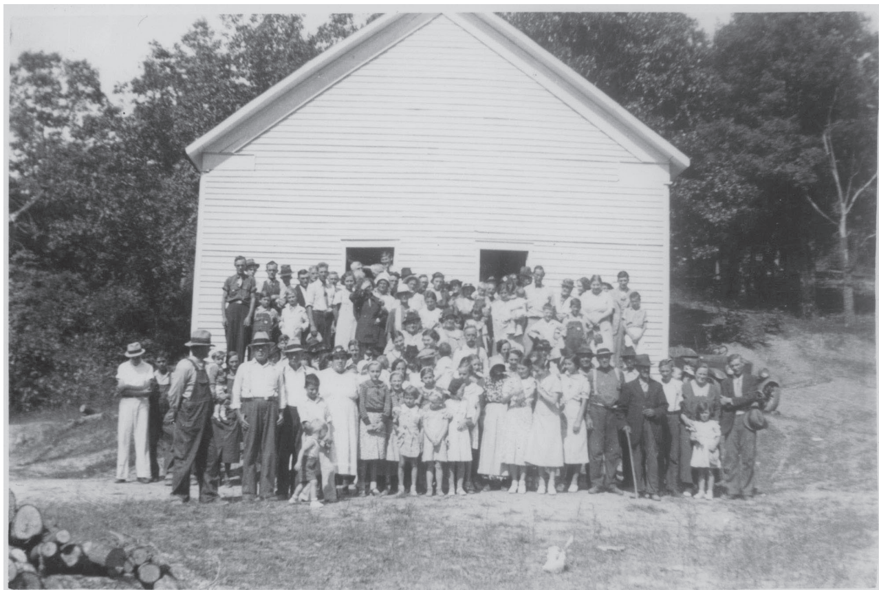
Lacy Creek 1940